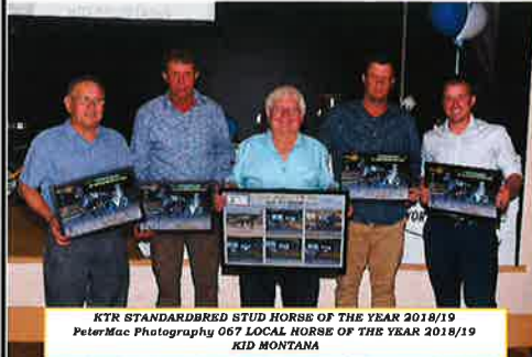
KTR STANDARDBRED STUD HORSE OF THE YEAR 2018/19 067 LOCAL HORSE OF THE YEAR 2018/19 KID MONTANA