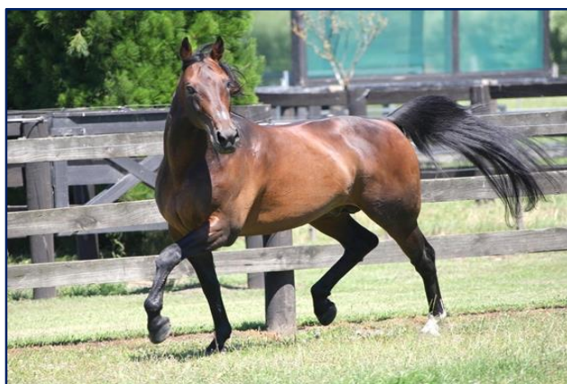
Live or Die

As a sire Changeover is off to a wonderful start with 10% of his entire FIRST CROP of foals RACE WINNERS as TWO-YEAR-OLDS. THREE CLASSICS WINNERS in his first crop to date. As at 16 March 2015 Australia's Leading 3YO Pacing Sire by Average Earnings. Nuala provided Changeover with his first Group winner when she captured the Group 2 $50,000 Dainty's Daughter Classic. He stands at Aus$4400 inc. GST.